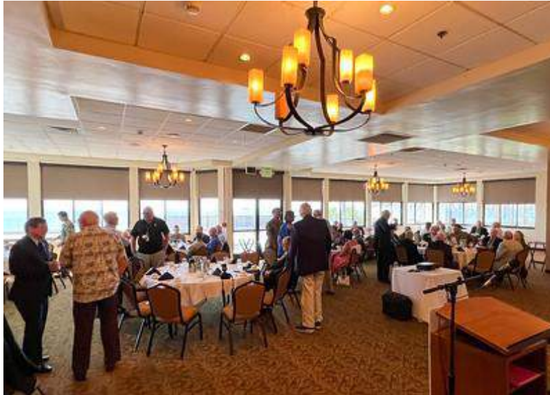
Our meeting venue in the Oceanview.