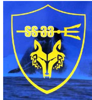
BAP PISAGUA (SS-33) arriving in San Diego, 19 Aug 2022.