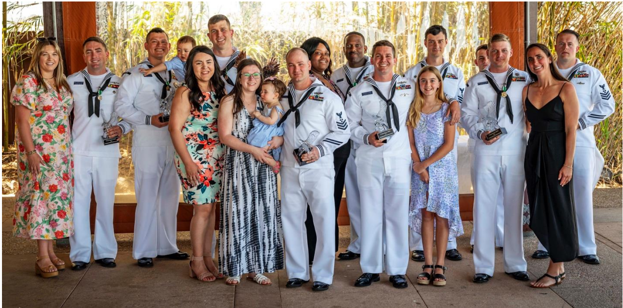
SUBPAC SOY candidates and their families at the Bali Hai award ceremony.