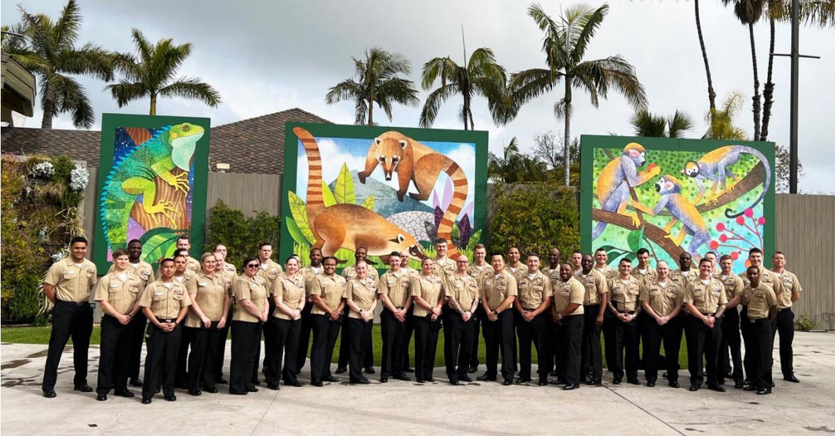
All of the SOY candidates gathered at the kickoff ceremony & breakfast at the San Diego Zoo