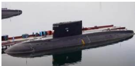
Type 636 (like Russian Kilo)