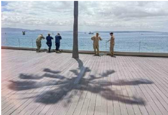
Beautiful spring day at the Oceanview.