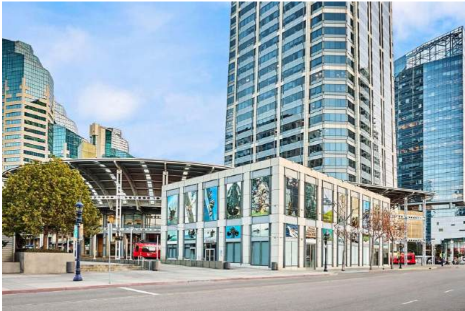
Artist's rendering of the Navy SEAL Museum San Diego in downtown.

The San Diego Museum's operating hours will be 10 AM to 5 PM, Wednesdays – Mondays (closed Tuesdays). Tickets will be sold online for timed entries. Prices have not been announced. The Navy SEAL Museum San Diego's website is here .