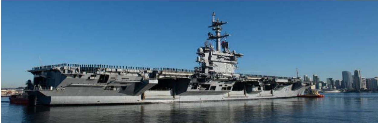
USS ABRAHAM LINCOLN dockside in San Diego.