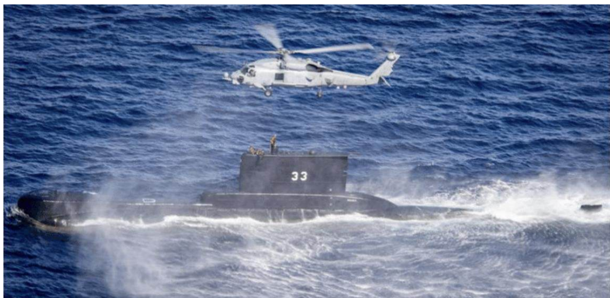
U.S. Navy MH-60R assigned to "Sea Hawks" of Helicopter Maritime Strike Squadron (HSM) 41 hovers over Peruvian submarine BAP Pisagua (SS 33) during a hoisting exercise off the coast of San Diego as part of the Diesel-Electric Submarine Initiative (DESI) exercise on October 2024.