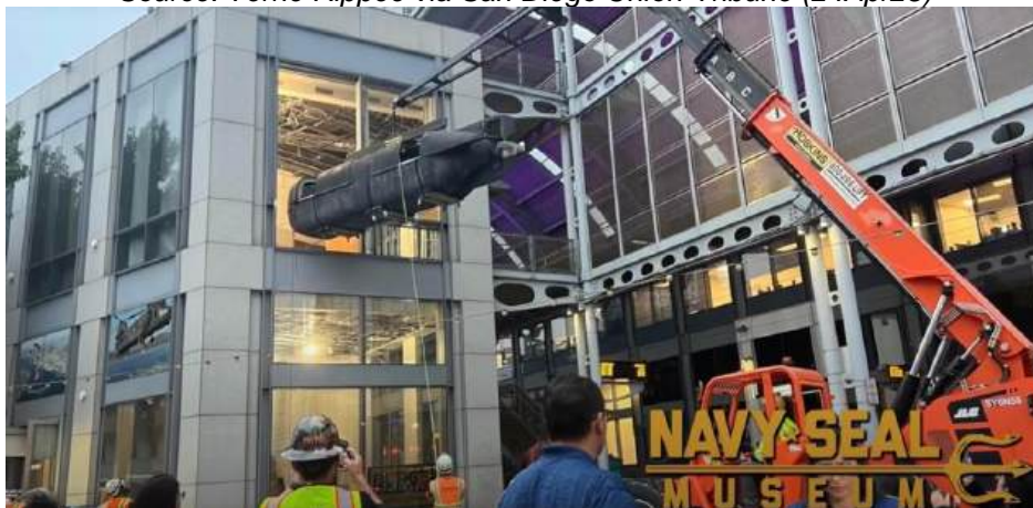
Seal Delivery Vehicle delivered through a second floor window to the Navy SEAL Museum, September 2024.

You can watch a short (2:41 min) video showing the arrival and installation of the SEAL Delivery Vehicle during construction of the museum in September 2024 here .