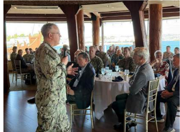
(Above) RADM Seif provided a detailed briefing on the U.S. Pacific Fleet's Submarine Force and progress being made with Australia and the UK on implementing the multi-lateral AUKUS agreement.