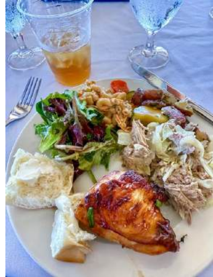
Bali Hai served a fabulous Polynesian-style buffet.