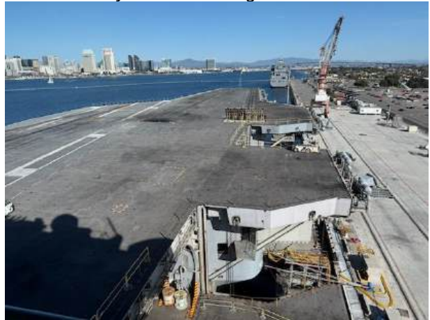
Above: The CO's station on the bridge and view toward the bow. Below: NSLPACSW tour group and guides on the flight deck.