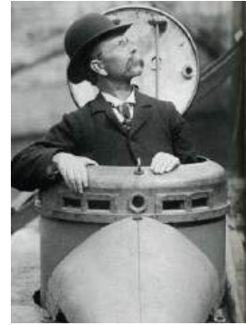
John P. Holland

National Submarine Day honors the anniversary of the day in 1900 when the U.S. Navy acquired its first modern submarine, the Holland VI (later renamed SS-1), which was designed by Irish-American inventor John Phillip Holland and built by his Holland Torpedo Boat Company. You'll find more information on the Holland IV and the very closely related Holland IV-derivatives operated by the UK and Japan here .