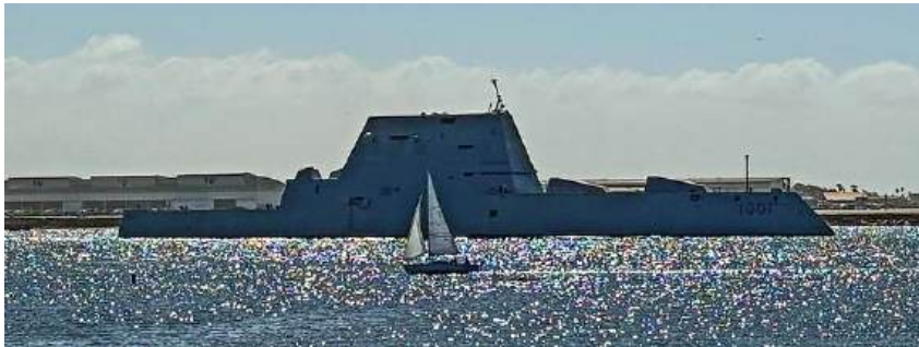
(Left) Zumwalt-class destroyer USS MICHAEL MONSOOR (DDG-1001) cruised by the Bali Hai Restaurant.