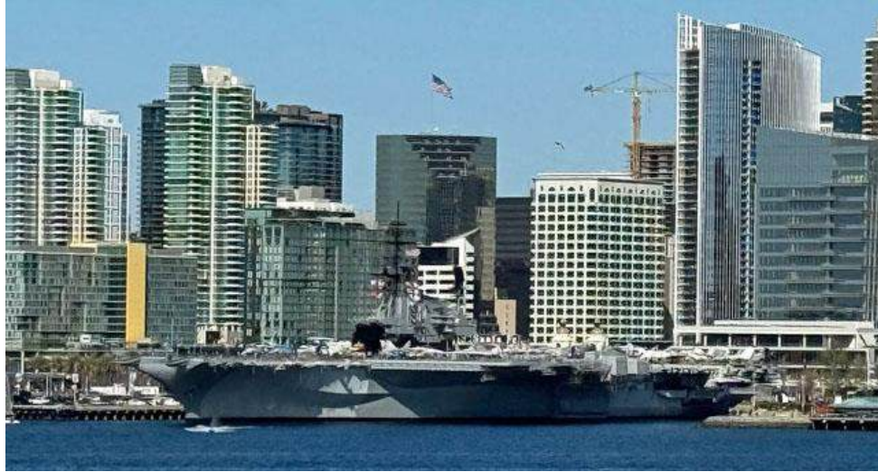
The USS MIDWAY Museum and downtown San Diego viewed from USS ABRAHAM LINCOLN.