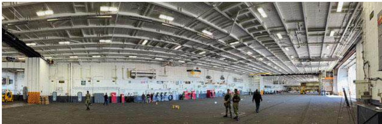
The huge hangar bay has three big sections, each of which can be isolated with fire doors.