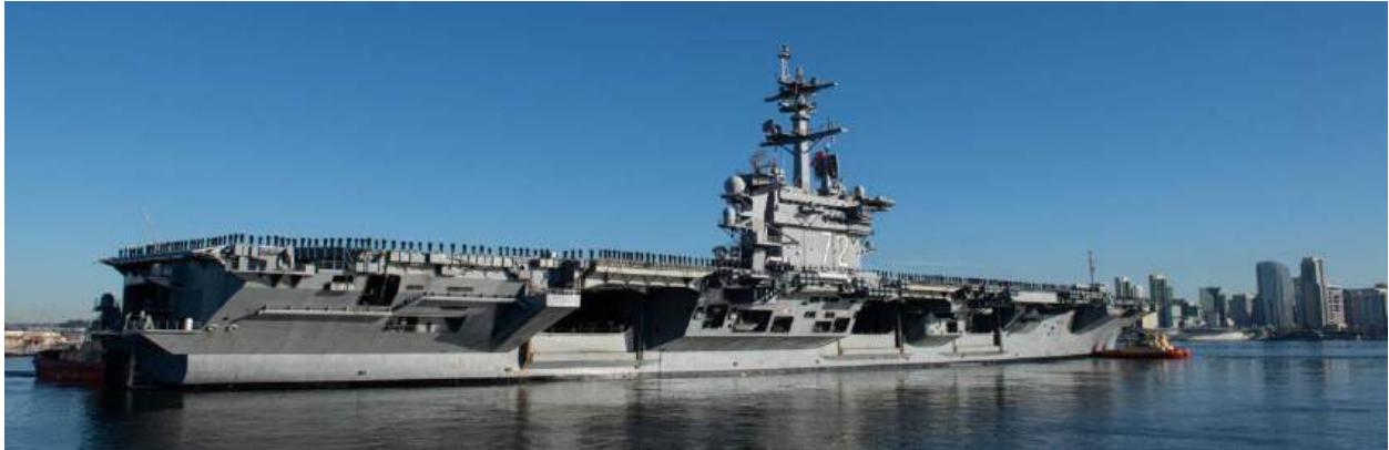
USS ABRAHAM LINCOLN dockside in San Diego.