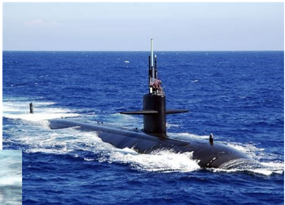
USS Key West (SSN 722)