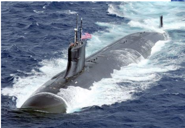
USS Connecticut (SSN 22)