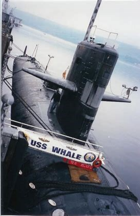
USS Whale (SSN 638)