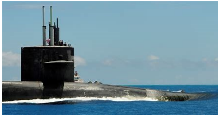
USS Florida (SSBN 728)