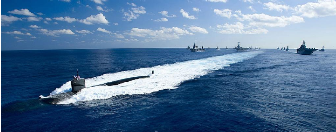
A Carrier Strike Group in formation.