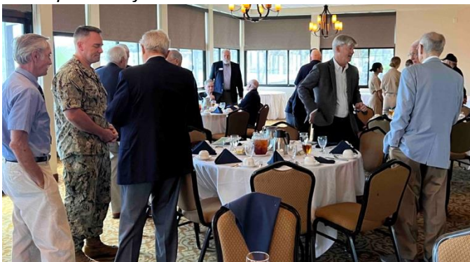
There's always time for good social interactions before lunch is served.