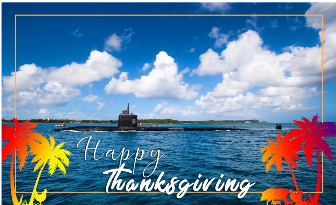
SSN off Santa Rita, Guam (but it looks like Point Loma).

Happy Thanksgiving to all submariners, their families and the extended submarine community!