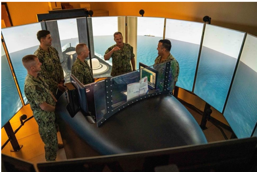
Rear Adm. Jeff Jablon, commander, Submarine Force, U.S. Pacific Fleet, tours the Integrated Submarine Plotting and Navigation Trainer at Naval Submarine Training Center Pacific in Santa Rita, Guam. Source: U.S. Navy (29 May 2021)

Photos were not permitted in the Learning Center. However, this published Navy photo shows the general arrangement of a similar Navigation Trainer.