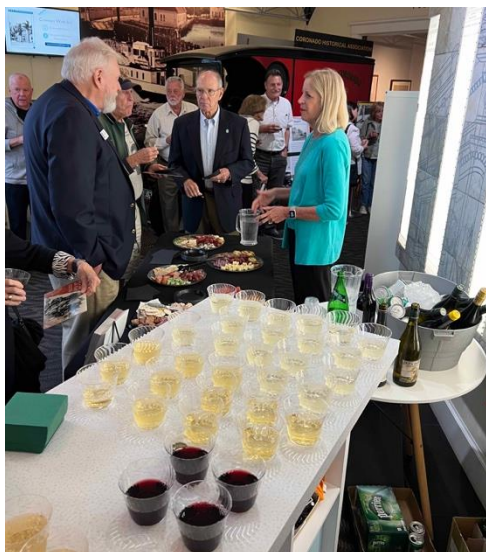
Reception before the panel discussion.