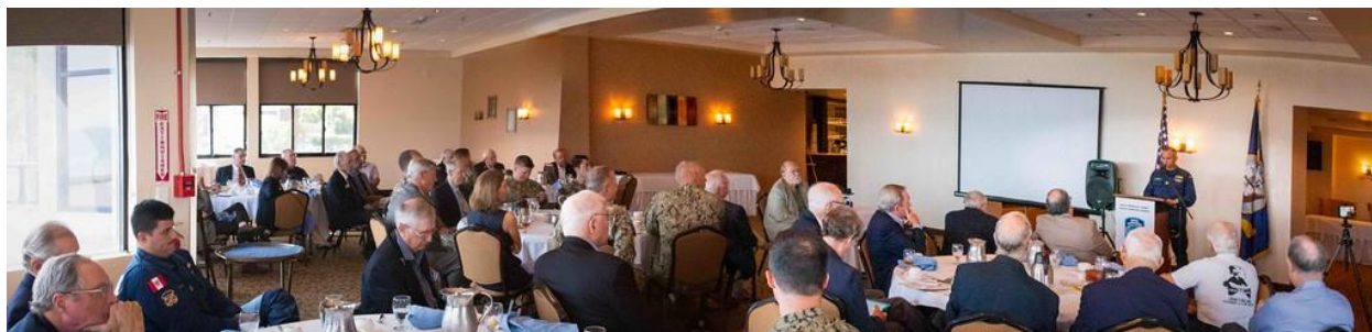
Our venue at the Oceanview on Naval Base Point Loma. About 42 people attended the luncheon.