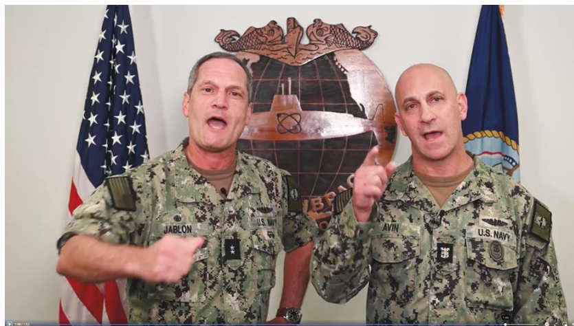
Happy 123 rd Birthday from COMSUBPAC.

https://www.facebook.com/watch/?v=742105904211795&ref=sharing