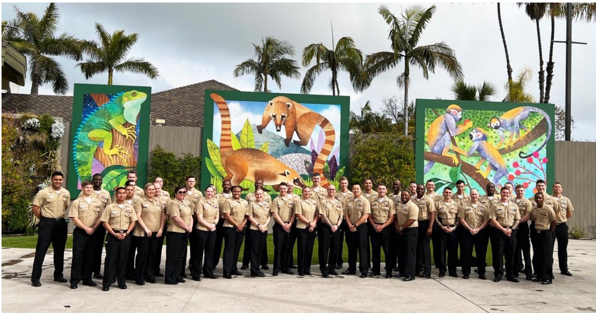
All of the SOY candidates gathered at the kickoff ceremony & breakfast at the San Diego Zoo