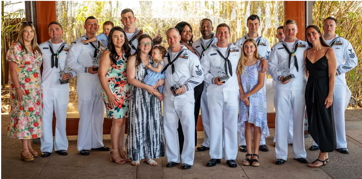
SUBPAC SOY candidates and their families at the Bali Hai award ceremony.