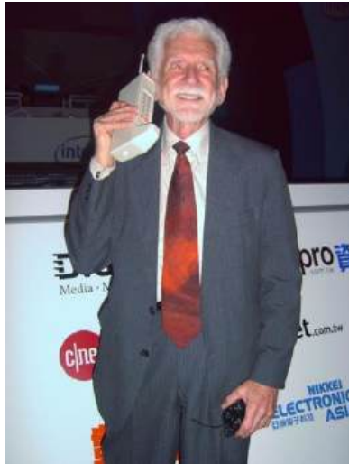
(Left) Marty Cooper, inventor of the cellular mobile phone in 1973 and the Naval Submarine League's 2022 Distinguished Submariner. On 3 January 2025, Marty was among a group of distinguished individuals who were awarded the 2024 National Medal of Technology and Innovation . This award is the nation's highest award for technological achievement. It recognizes American innovators whose vision, intellect, creativity, and determination have strengthened America's economy and improved our quality of life. Congratulations, Marty!