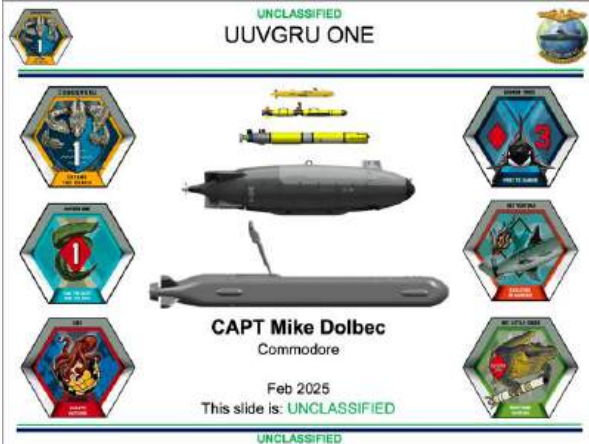
CDRE Dolbec provided an overview of UUVGRU ONE's mission and its growing fleet of very capable UUVs, which range in size from small-to-medium (S/MUUV) to extra-large (XLUUV).