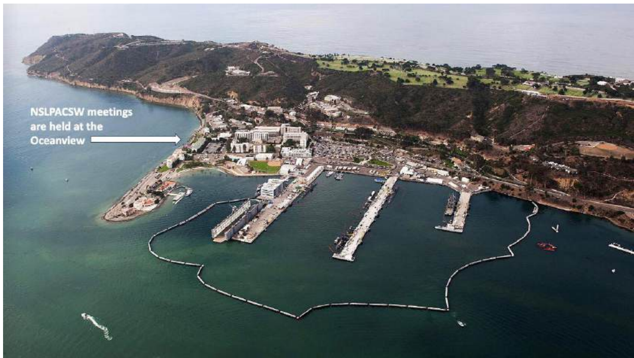
Aerial view of Naval Base Point Loma, homeport for CSS-11.

Scranton (SSN-756), USS Alexandria (SSN-757), USS Santa Fe (SSN-763) and USS Greenville (SSN-772). In addition, USS Asheville (SSN-758) is visiting NBPL from Submarine Squadron 15 in Guam for work currently being performed in floating dry dock ARCO. These SSNs are capable of conducting various missions, including: anti-submarine warfare, anti-ship warfare, strike warfare, and intelligence, surveillance, and reconnaissance. Some personnel assigned to CSS-11 also serve under the SUBPAC umbrella, as members of SUBPAC Representative West Coast (CSPRWC). CSS-11 and CSPRWC also manage emergency response procedures from the Emergency Control Center (ECC), located near the crest of Point Loma.