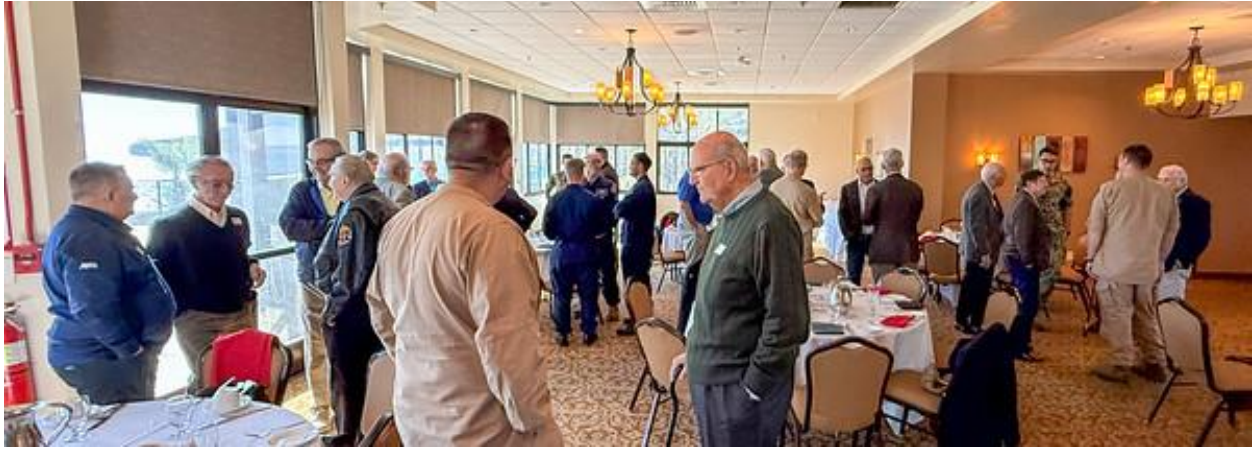
There was a good turnout for the Chapter's first meeting in 2025.