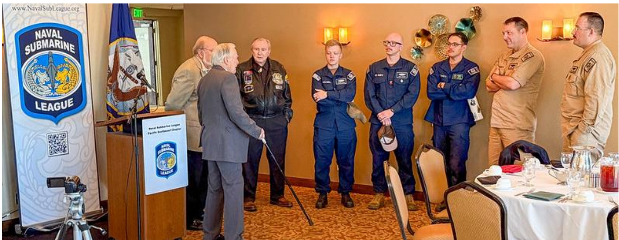
Sharing sea stories (some true) with the USS Greenville CO & crew members.