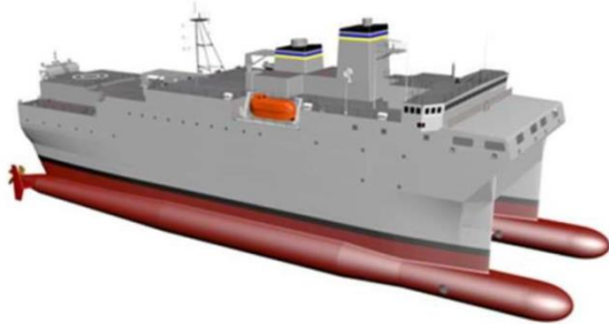
T-AGOS-25.

On 10 January 2025, the Secretary of the Navy announced that the Explorer-class tactical auxiliary general ocean surveillance ship T-AGOS-25 will be named in honor of former submariner and oceanographer CAPT Don Walsh. The new 356 feet long vessel will be operated by the Military Sealift Command to conduct open ocean anti-submarine surveillance. You'll find more information of the T-AGOS-25 here .