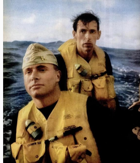
LT Don Walsh was officer in charge of the bathyscaph Trieste and Jacques Piccard was the pilot.

After finishing submarine school, Walsh served aboard the submarines Rasher (SSR-269), Sea Fox (SS-402), and Bugara (SS-331), eventually commanding Bashaw (AGSS-241). Thereafter, LT Walsh served aboard the Trieste from 1959-1962.