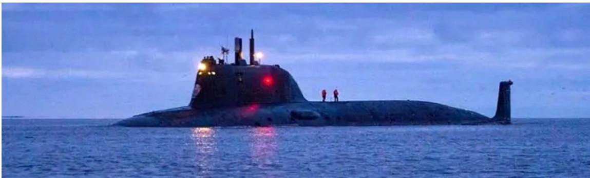
Yasen-class sub. 1 st of five entered fleet in 2014, newest in Dec. 2024.