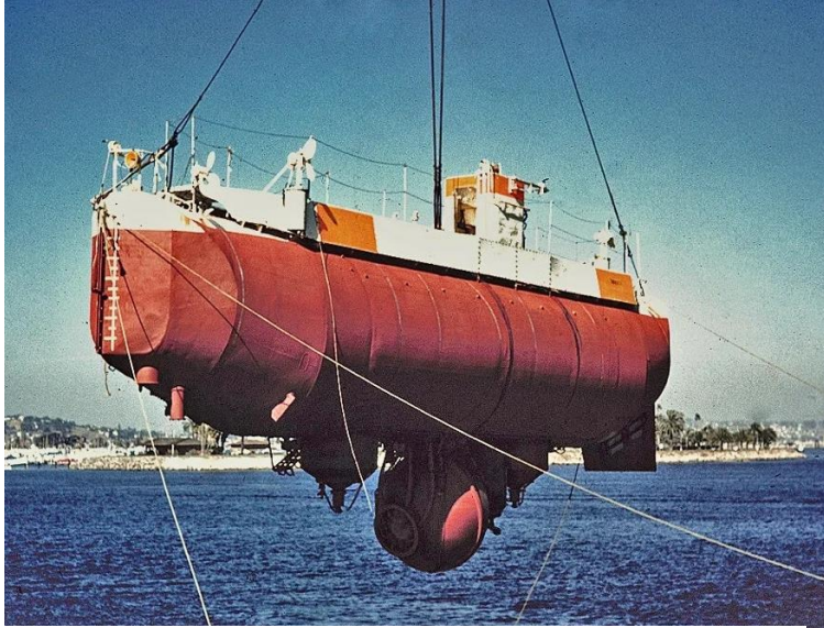
Bathyscaph Trieste at the submarine base at Point Loma in the early 1960s.