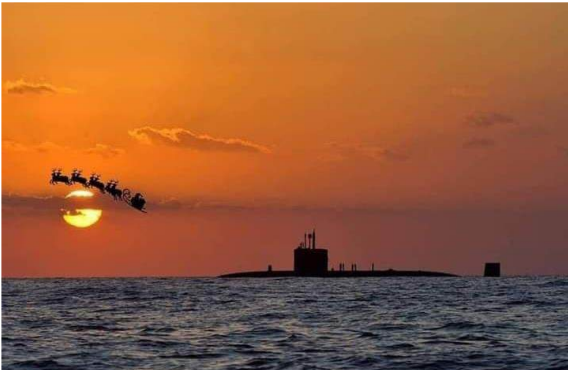
Merry Christmas to all, and especially to the families with crew members deployed during the holiday season. Source: The Submariner's Pub, Two Rivers, WI

Check the NSLPACSW website for a more complete listing: 2024/2025 calendar of events .