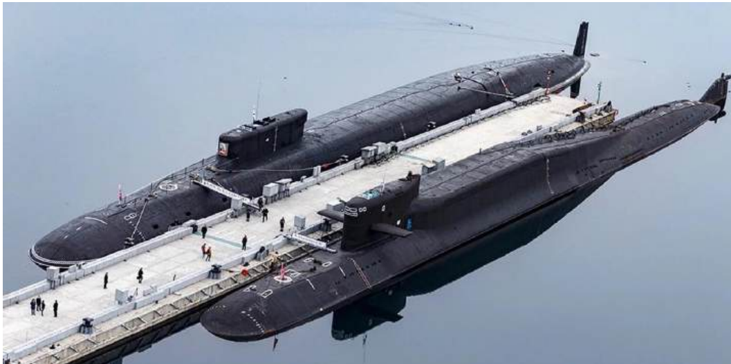
Comparison of two classes of Russian SSBNs: Prince Vladimir (above, Project 955A Borei-class) & Yekaterinburg (Project 667 BDRM Delfin / Delta IV-class) docked at a Russian naval base in Gazhiyevo, Kola Peninsula, Russia. Source: Russian Defense Ministry Press Service via AP, 13 April 2021