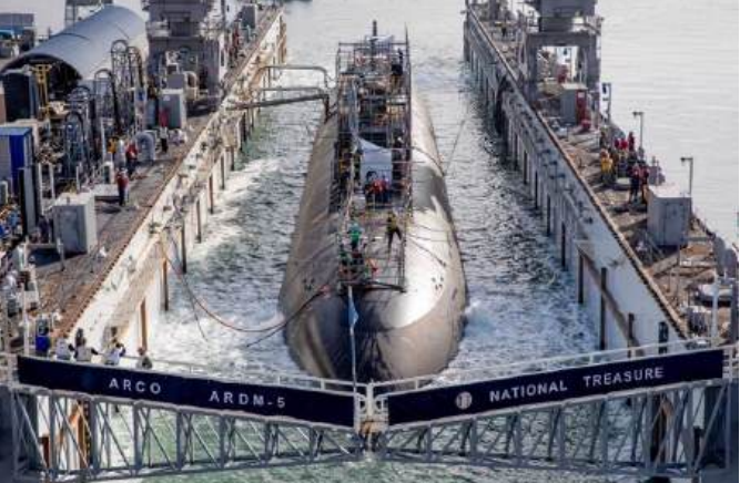
USS Scranton in ARCO.