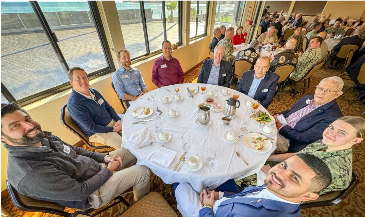
We had a full house for this luncheon with COMSUBPAC.