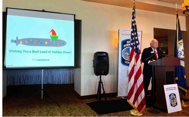
Bruce Renne concluded the meeting with holiday wishes to all.

More photos from the December 2023 luncheon are posted on the NSLPACSW website here: Slideshow and Photo Gallery . A video of the CAPT Witte's presentation is posted on the NSLPACSW website here and you can view his PowerPoint presentation here .