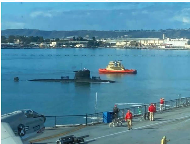
CARERRA sailed by the USS Midway