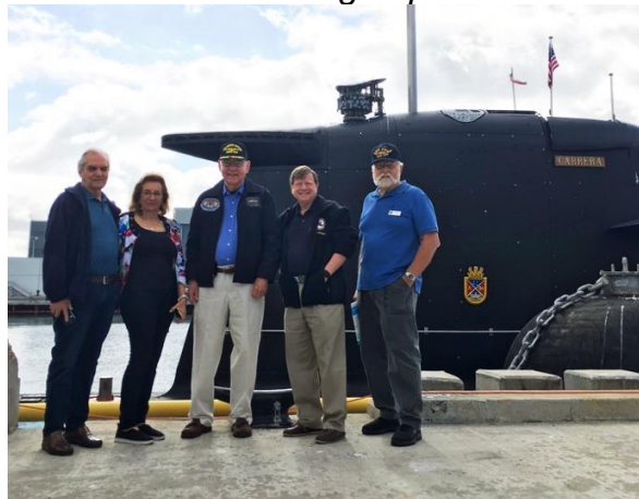
Tour group 3