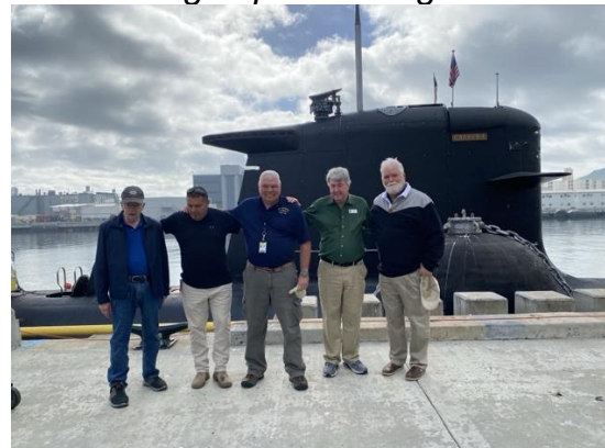
Tour group 2