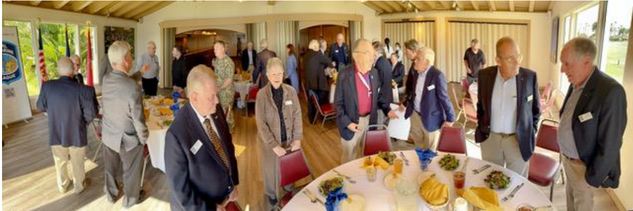
The Bayview Restaurant was a fine venue for this luncheon meeting.