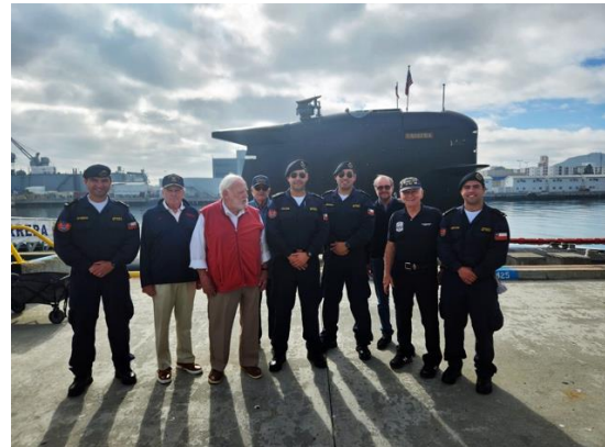
Tour group 1 & tour guides