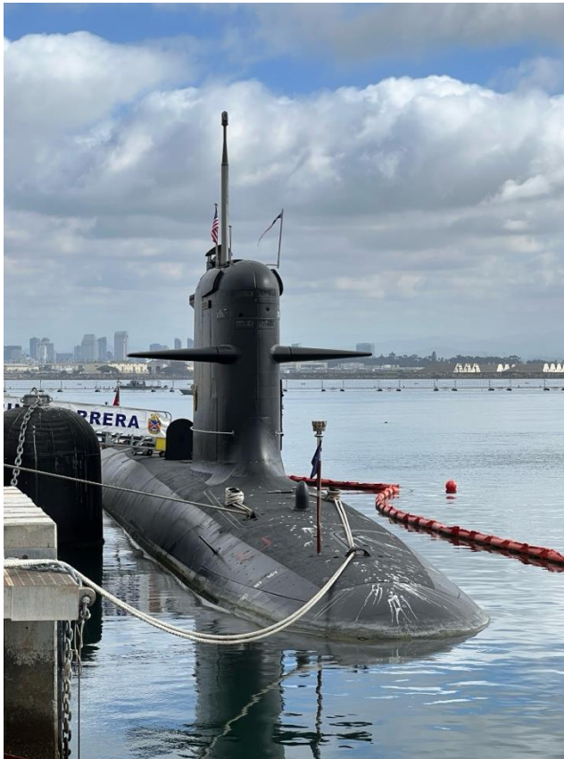
CARERRA docked at Naval Base Point Loma

On 7 November 2023, 15 NSLPACSW members and friends toured the CS GENERAL CARERRA, which was docked at Naval Base Point Loma. This modern Scorpène -class diesel-electric submarine was in San Diego to participate in this year's DESI program (Diesel-Electric Submarine Initiative) with U.S. Navy surface and submarine forces. It was constructed by the French company Naval Group (formerly DCNS) and the Spanish firm Navantia and was commissioned in July 2006.