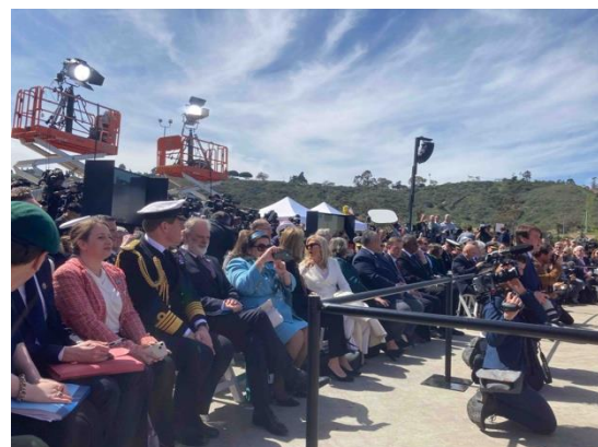
President Biden speaks to the assembled dignitaries and guests.