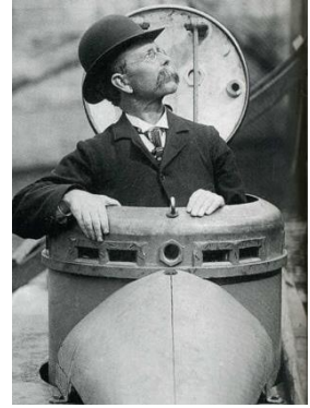
John P. Holland

http://pacificsouthwest.navalsubleague.org nslpacsw@hotmail.com