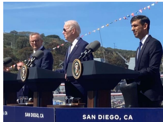
(L to R) PM Albanese, President Biden and PM Sunak on the dais at NBPL.