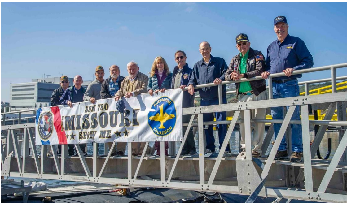
NSLPACSW members on the USS MISSOURI's brow.

NSLPACSW appreciates the opportunity afforded by CSS 11 and the USS MISSOURI to tour a visiting Virginia-class SSN, which is a rarity in San Diego.