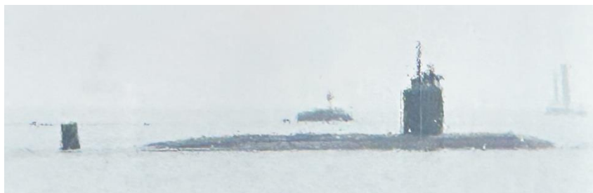
Pearl Harbor-based Los Angeles-class USS Charlotte (SSN-766) departed San Diego during our luncheon.