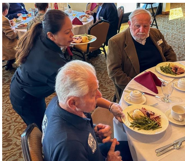
Left: Oceanview staff served a great holiday luncheon with ham, mashed potatoes and green beans, and pumpkin pie for dessert.

You'll find more photos of the December 2022 Luncheon / Professional Forum here .