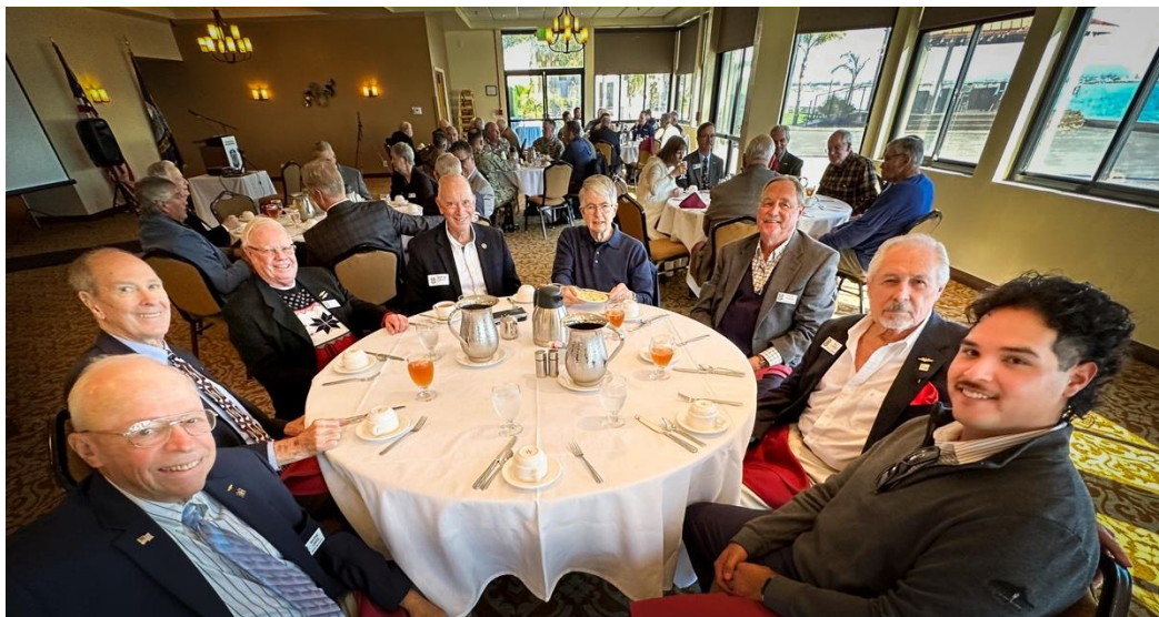
Above: We had a good turnout, with 51 attendees.