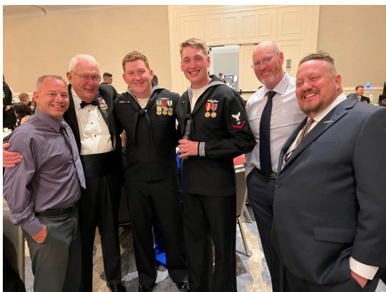
The Newest Qualified in Submarines—USS HAMPTON