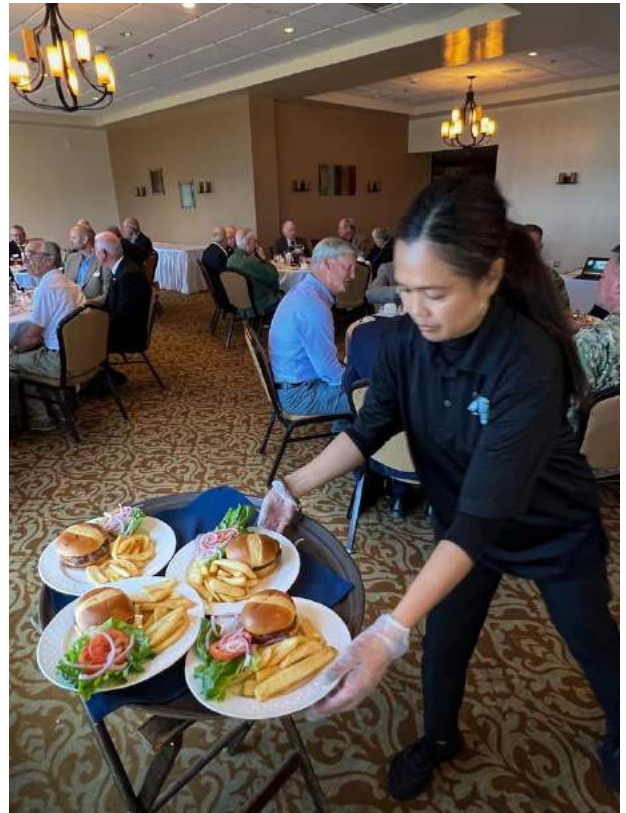
Oceanview staff served another great lunch.