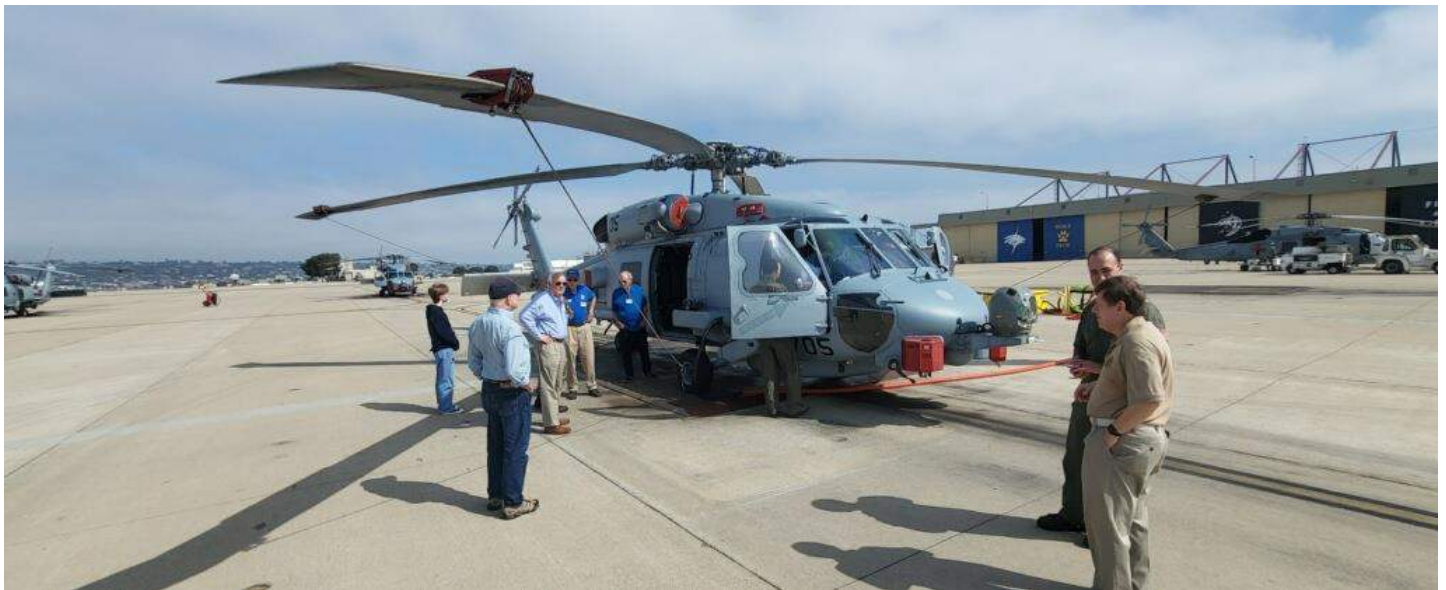
NSL PACSW members & guests get up close and personal with an MH-60R on the NAS North Island flight line.