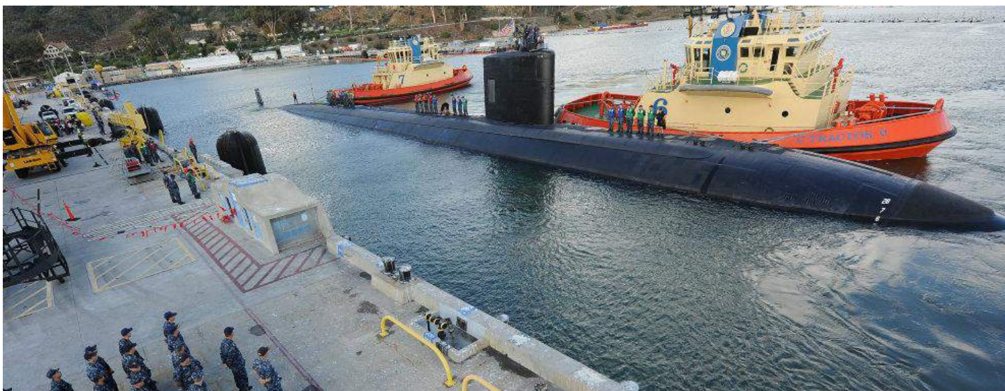
USS ALEXANDRIA (SSN 757) at Ballast Point.