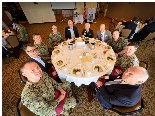
The Head Table Looks Ready for Meatloaf - And it was Good!