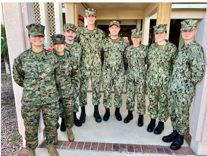
Midshipman March On San Diego NROTC is Well Represented