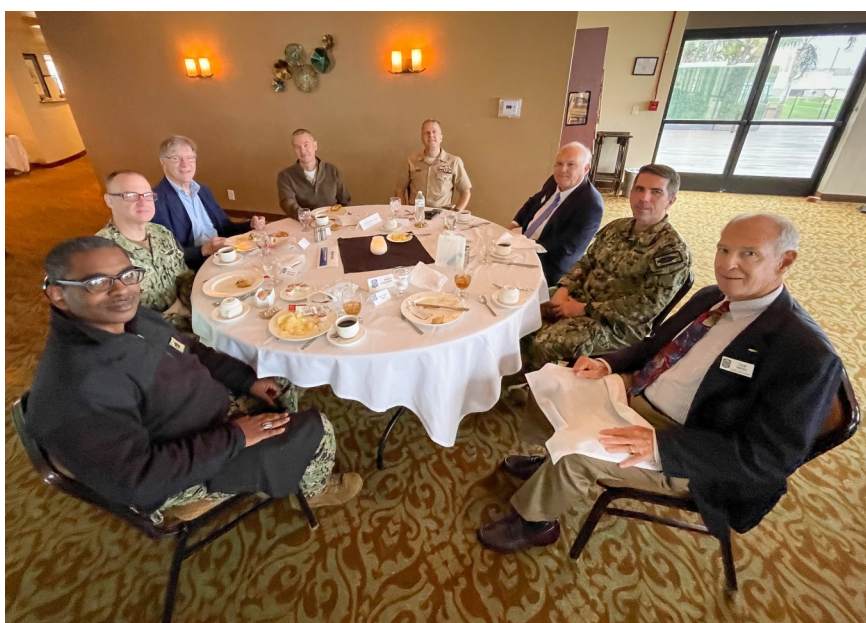
The Head Table