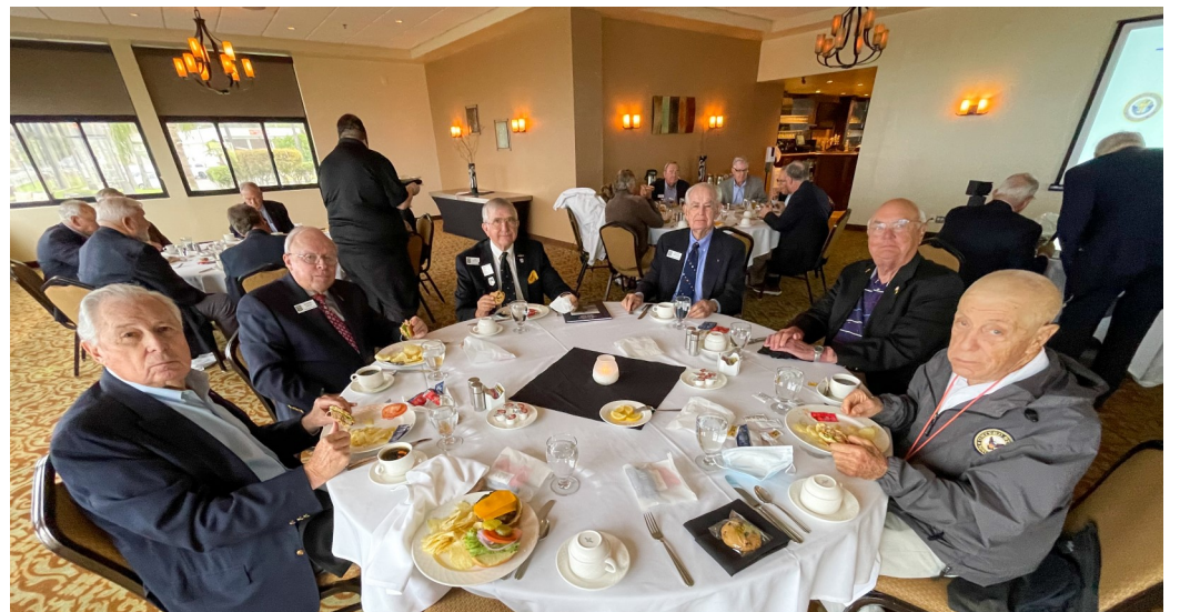
We don't say "Ancient Mariners". To us they are Mature Mariners.