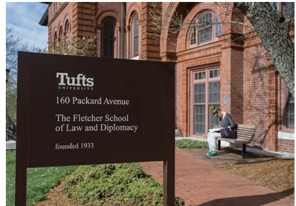
The Fletcher School of Law and Diplomacy