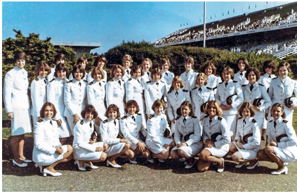
The USNA Class of 1980 Women The First Class to Graduate Women