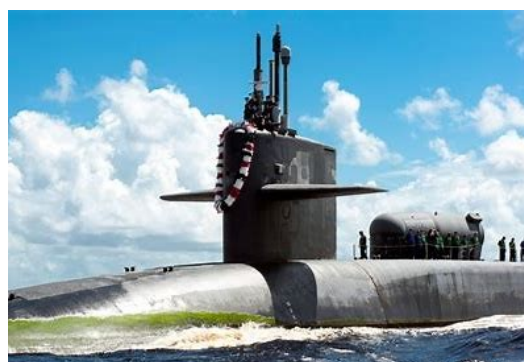
USS GEORGIA (SSGN-729)