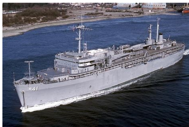
USS McKee (AS-41)